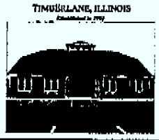
TIMBERLANE, ILLINOIS Established in 1999

This is To County Plan This is an Original Official Zoning Map Pursuant to CHAPTER 1, Article 1A of The Village of Timberlane Zoning Ordinance. This is a COPY that is the Original Official Zoning Map prepared by the Village of Timberlane. It is not to be used for any other purpose. Prepared by: CES Approved by: Village President Approved by: Village Clerk Date Adopted: _____